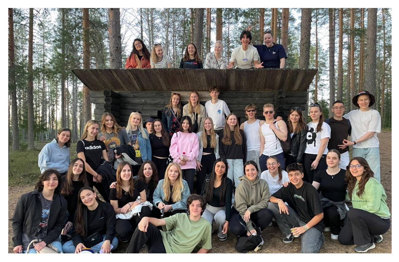
"These trips are not about how much you knew but how much you learned."

"The best part of the project is getting to know about different cultures and manners. Also getting to meet people from different countries and making friends and connections."