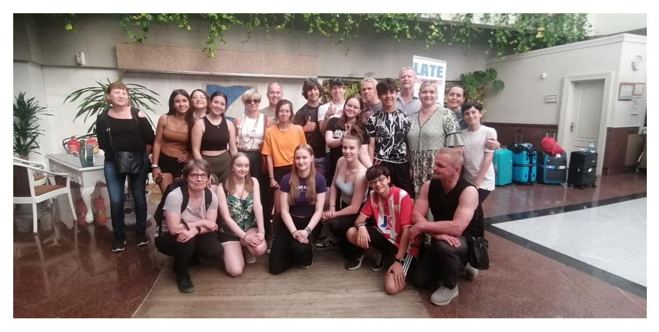
"We have learned a lot from different cultures, the most interesting thing is to learn the habits that these countries have."

aware of our planet and the most important, getting along with all the world in just a week was mind-blowing. I am so lucky to be a part of this. "